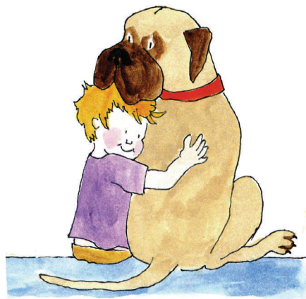
Illustration from Henry & Mudge: The First Book by Cynthia Rylant. Used with permission from Simon & Schuster Children's Publishing Division.

When Henry's cousin Annie comes for a visit, Mudge is so charmed by her that he finally rolls over at her command! Henry thinks Mudge must love Annie more than him, because the dog only does the trick for her. Very upset, Henry runs away into the cold dark woods to find adventures on his own. Mudge follows the boy's scent into the forest -- he really does love Henry and doesn't want to be without him.